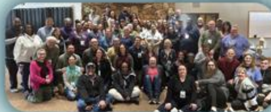
2025 Group Photo

Breakfast 8:30 am Session #4 10 am Lunch 12 pm Check-Out/Depart 1 pm